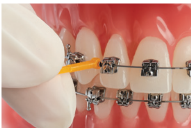
Twist to remove holder

SLX Cu Nitanium Archwires are also available with our optimal EZ Stops delivery system which incorporates tube stops pre-loaded onto a disposable holder, packaged pre-threaded on each wire.